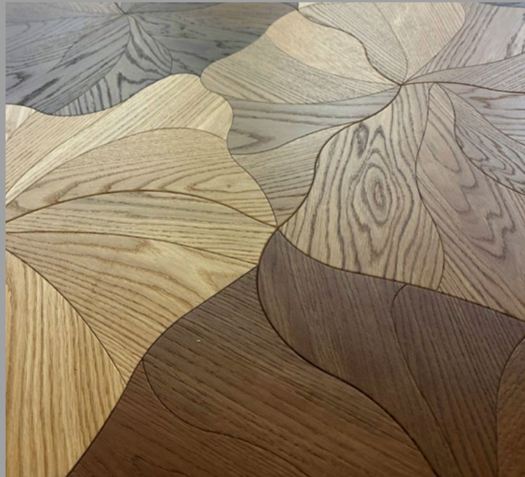
Pattern #2 Oak natural Oak 120° Oak 157°