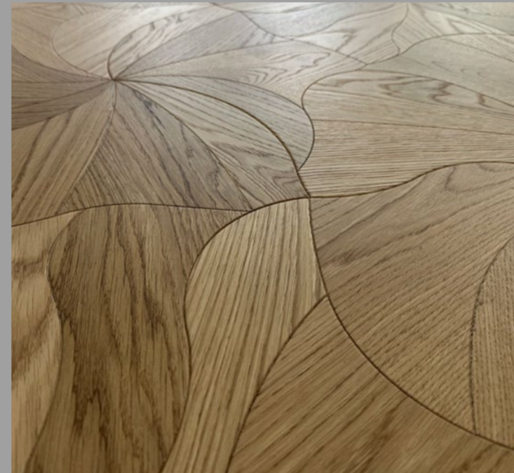
Pattern #1 Oak